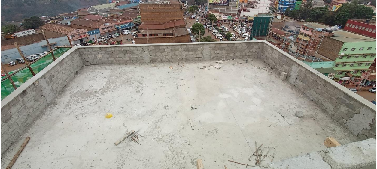
Figure 7: Parapet walls on the eighth level with concrete coping