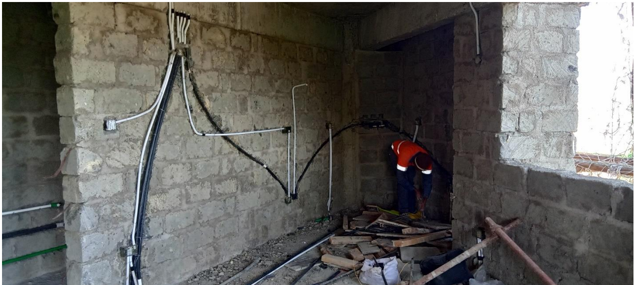
Figure 2: Ongoing electrical works on the fifth-floor