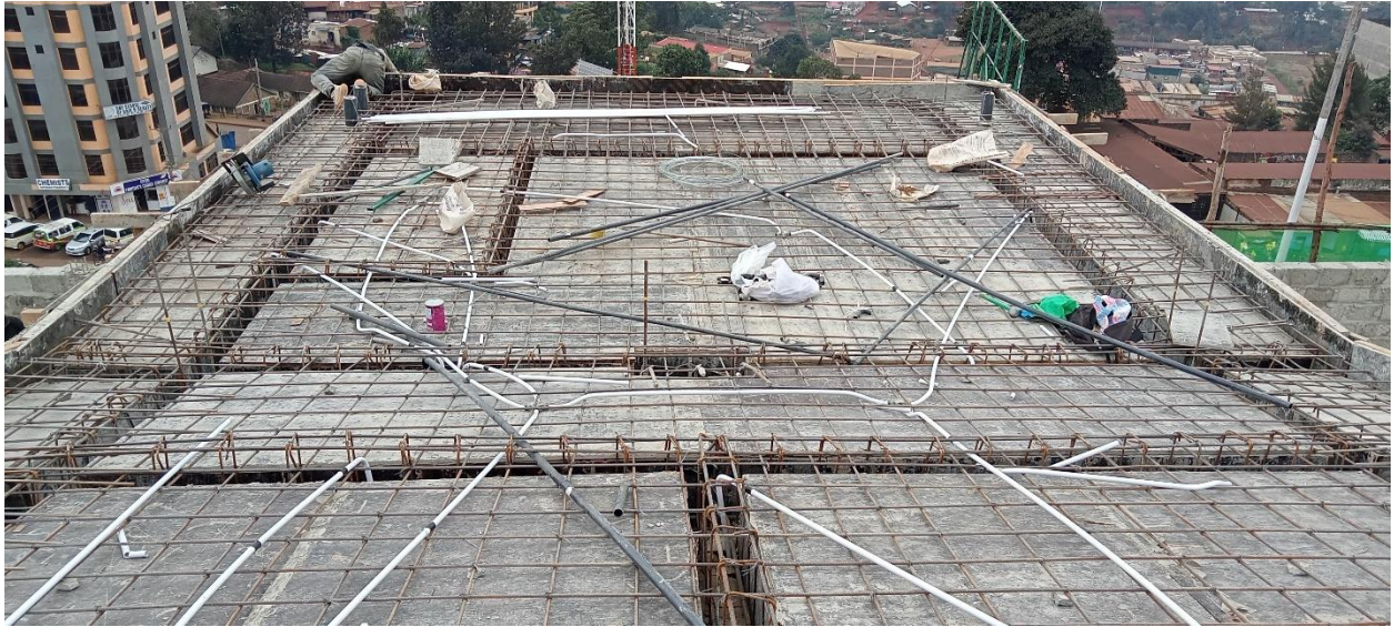
Figure 1: Inclined caretaker level roof slab completed steelworks, mechanical works and electrical works