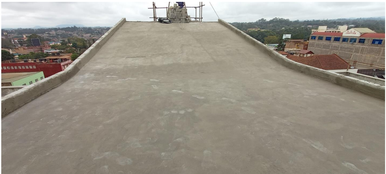
Figure 6: Completed roof slab with waterproof applied