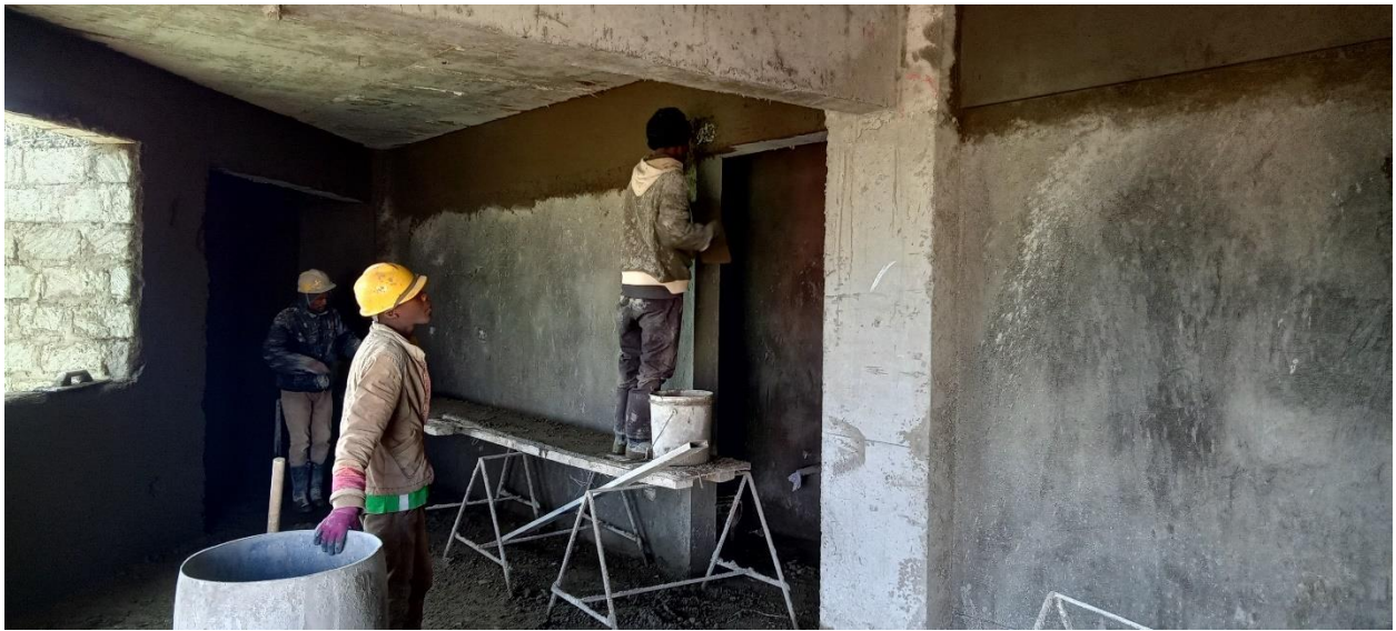
Figure 4: Plastering works on the fourth-floor