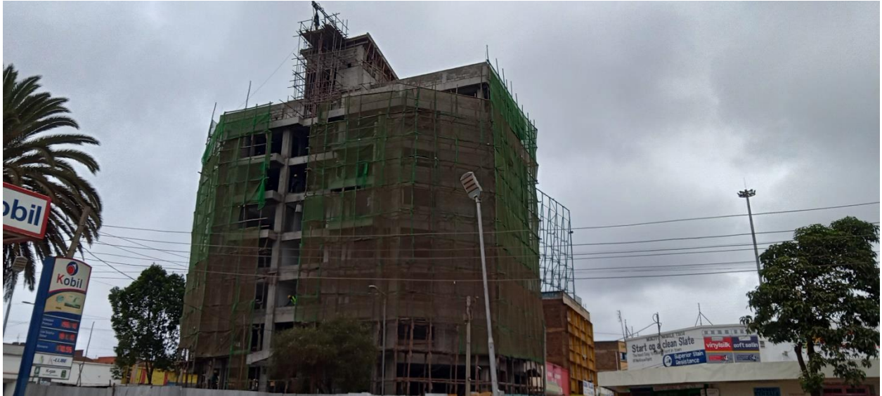
Figure 5: General overview of the site on 25/06/2023