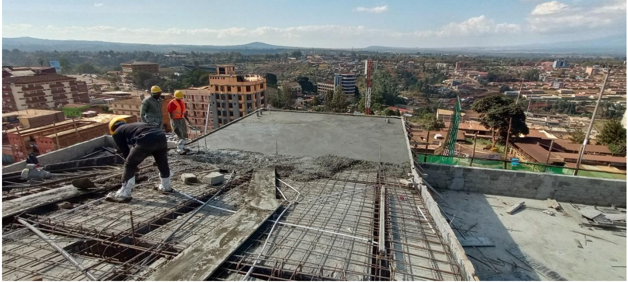
Figure 3: Casting of the inclined caretaker level roof slab